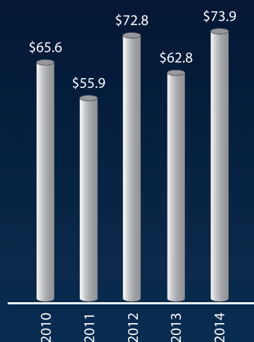
NET SALES FROM CONTINUING OPERATIONS Dollars in Millions